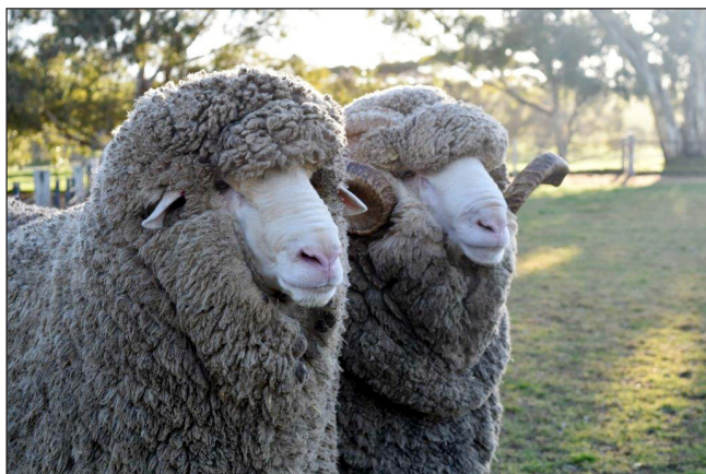
Stud Sires NA PA780 with Impact 3506

160 Quality Merino & Poll Merino Rams 300 Stud Ewes